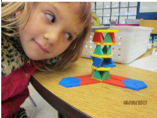
Exploring geometric shapes