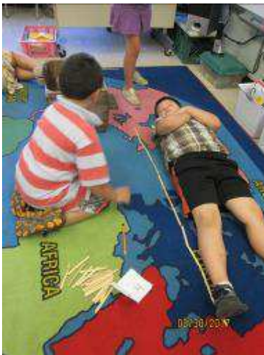
Above—measuring with non-standard units