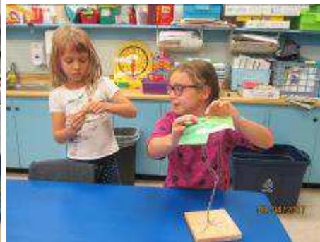
Designing shade on a tree